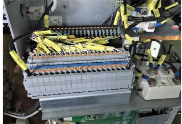
New terminal blocks with fuses (Fused TBs)

GE offers bespoke service support in the form of spares and replacement parts, onsite and remote technical support, maintenance services, upgrades, customized trainings and service agreements aimed at supporting customers based on their unique needs.